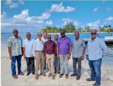
Group photo from the Moderator's Retreat with Ministers and Lay Pastors in Cayman Kai

The Moderator and the General Secretary concluded their visit to the CIRMC on October 31, 2022.