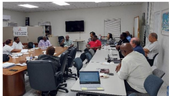
Meeting with Council Members at the Council Office

The busy schedule, full of engagements from morning till evening every day, included meeting with Members of the Council, a radio recording for the 'Worship the Lord' Programme, spending a pastoral Retreat with Ministers and Lay Pastors, attending a Council wide Youth Event and a Men's Fellowship Breakfast, visiting the retired Ministers, the Beth Shalom Mission House, the Bethesda Counselling Centre, and the Cayman Prep and High School. The special guests also participated in the 100th Anniversary Celebrations of the Elmslie Memorial United Church Sanctuary and preached on Sunday morning at the East End and South Sound Congregations.