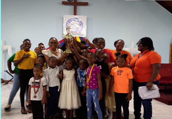
1st Place Bryce United