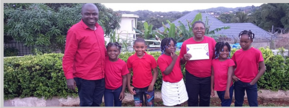
Grove Town United