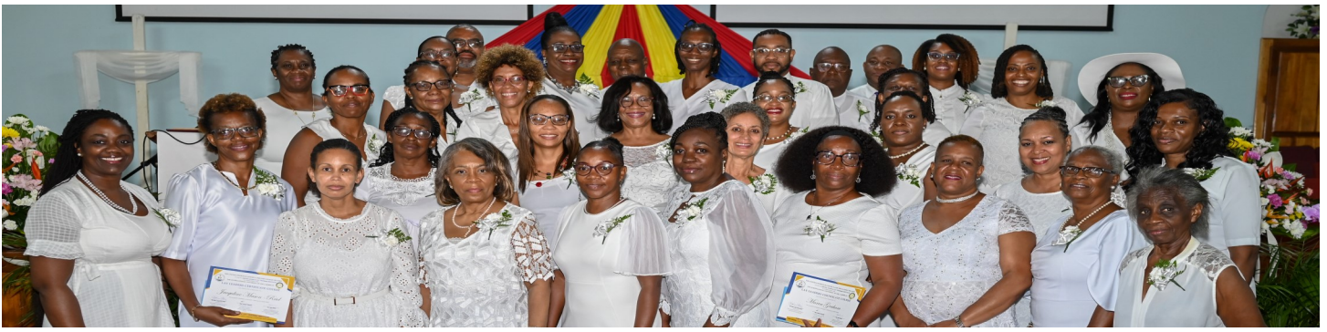
A fraction of the 2022 Lay Leaders Module 1 graduating class.