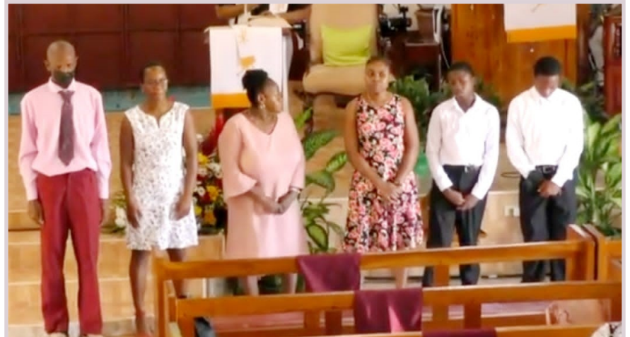
Candidates for Baptism