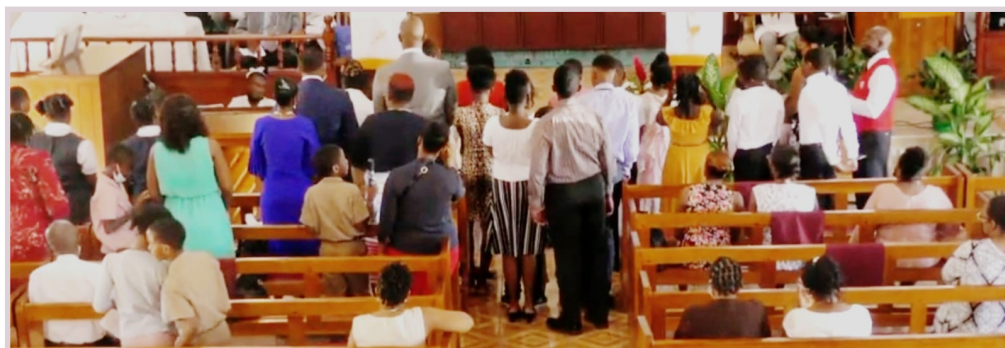
Special Prayer for our nation's children/schools. Bridgeport High School represented the island in the sanctuary.