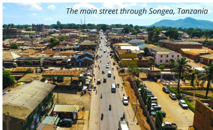
The main street through Songea, Tanzania