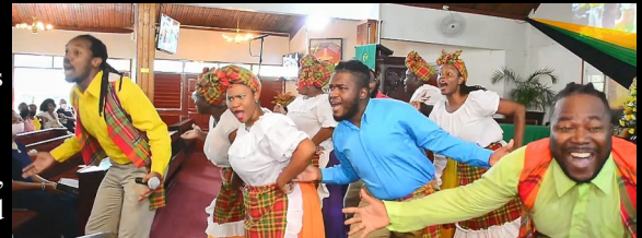
Nexus Performing Arts Company

The hosting churches, Bethel and Boulevard Baptist churches, Meadowbrook United, Webster Memorial United and Hope United churches, and the United Theological College of the West Indies, along with the Nexus Performing Arts Company provided rhythm to the evening’s proceedings with vibrant enriching performances.