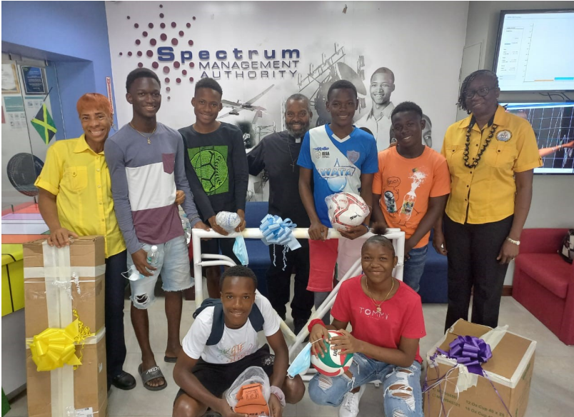
Spectrum Management Authority donates sports equipment to St John's United Church in Hannah Town for youth/community ministry.

On any evening, at least thirty to fifty youngsters, ages eight to 17, from beyond Hannah Town gather on the compound of the church where they play sports or just hang out. The game of choice is mostly football in the scrimmage format. The church has provided a safe space for them and the church has identified and embraced this as a ministry opportunity.