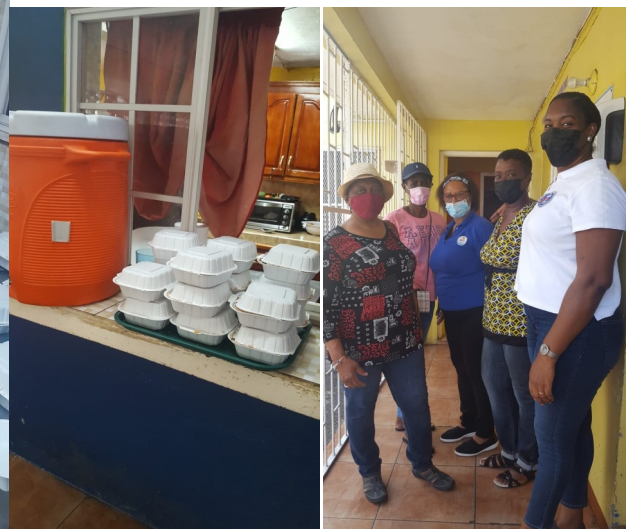
The Women's Fellowship of St. Paul's United in Montego Bay delivered 75 lunches to the homeless on April 7, 2022.