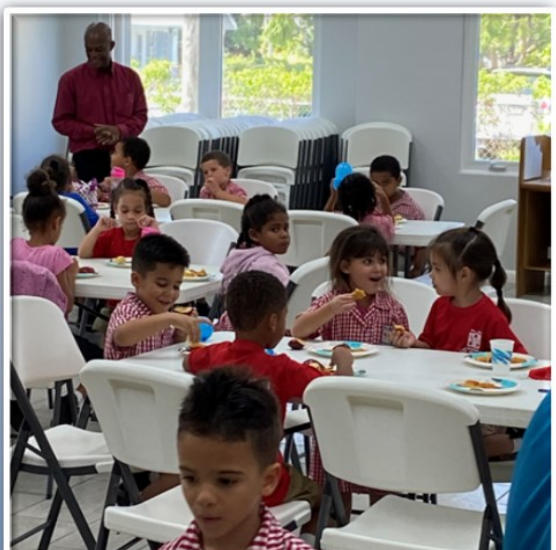
Snack-time is everyone's favorite!