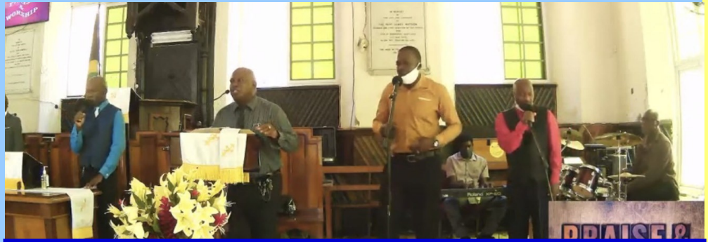
An all male praise team leads praise and worship at Lucea United Church on Mother's Day 2021.

We denounce the notion of men believing that they own women or that they are above women. God has called us as partners to coexist as partners with one another.