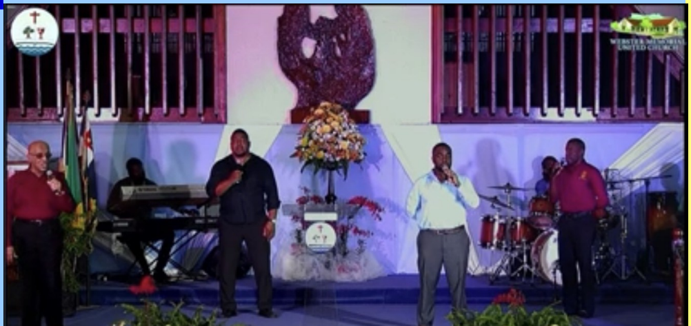
Webster Memorial Men's Chorale renders an item for Mother's Day, Sunday, May 9, 2021.

Photos: Men's Fellowship groups at Lucea United, Webster Memorial in Kingston, and Hope United, demonstrated appreciation for women in Mothers' Day tributes through music.